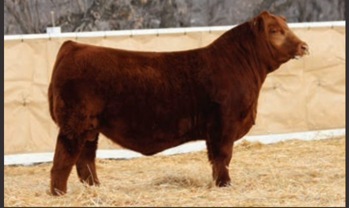
WHEATLAND Affinity 8196F