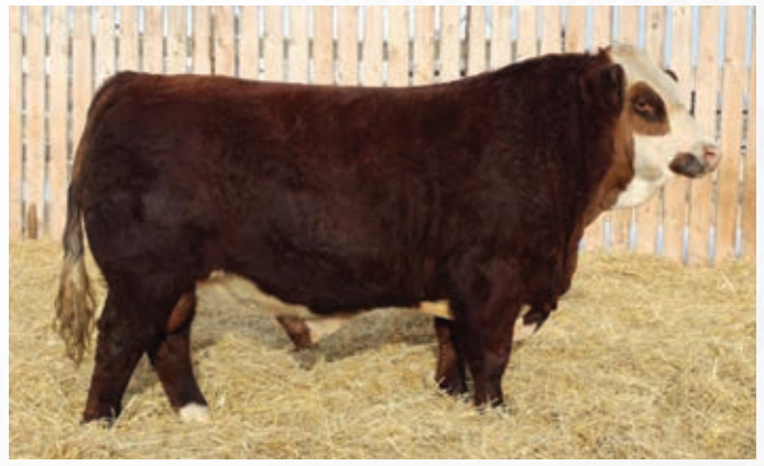
NAC Battle Cry 4F