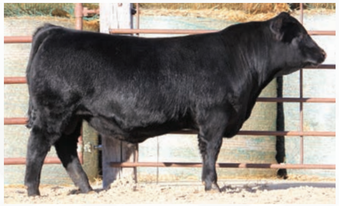
W/C Night Watch 84E