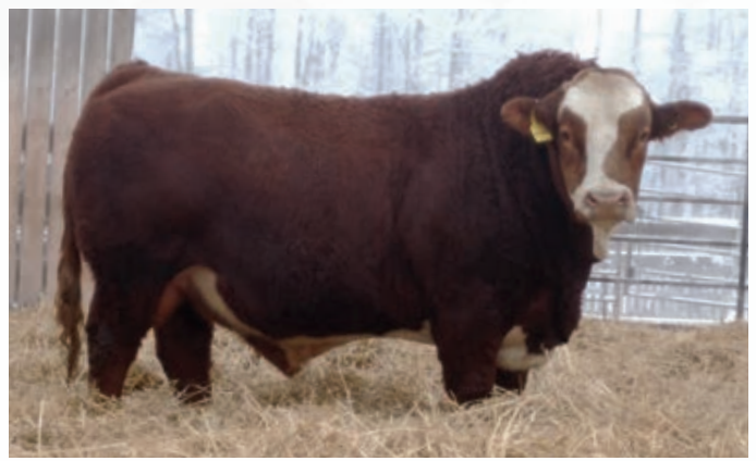
Anchor D Outlook