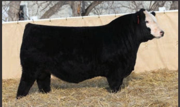
WHEATLAND Man O' War 907G