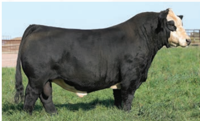
WC Bankroll 811D