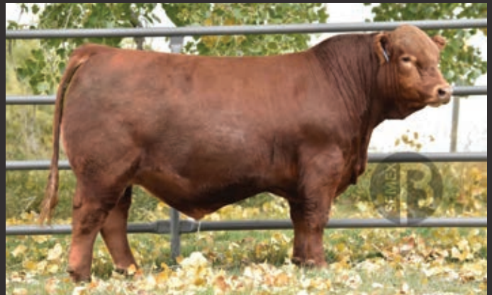
WS Epic E152