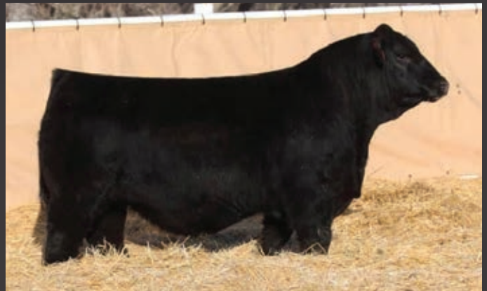
WHEATLAND Monument 28H