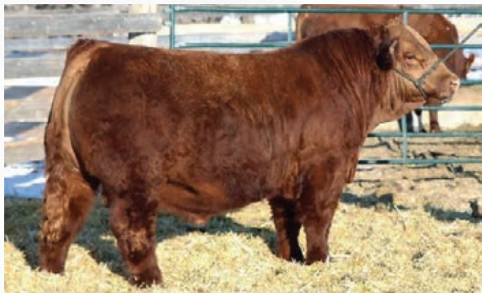
Black Gold Approval 71E