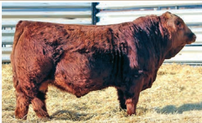
KWA Future 3G