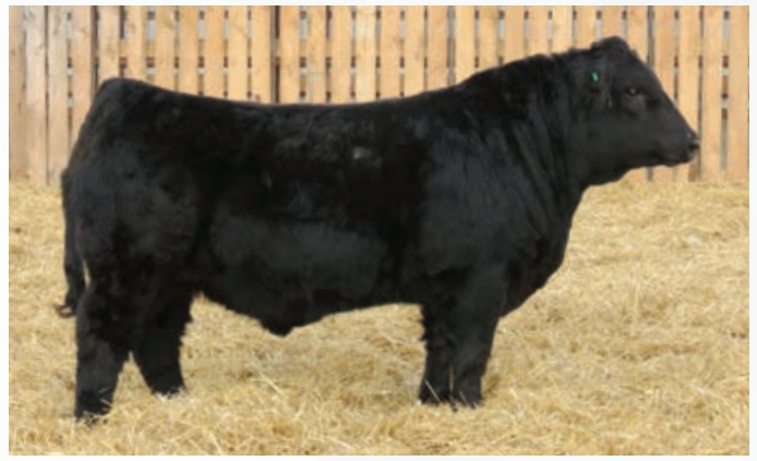
R PLUS 5051C