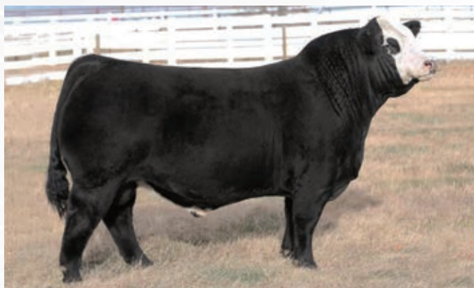
SRH Hannibal 5H